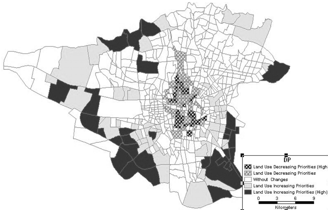
Fig. 4 Idealized Residential Land Use Priorities for Tehran TAZ.