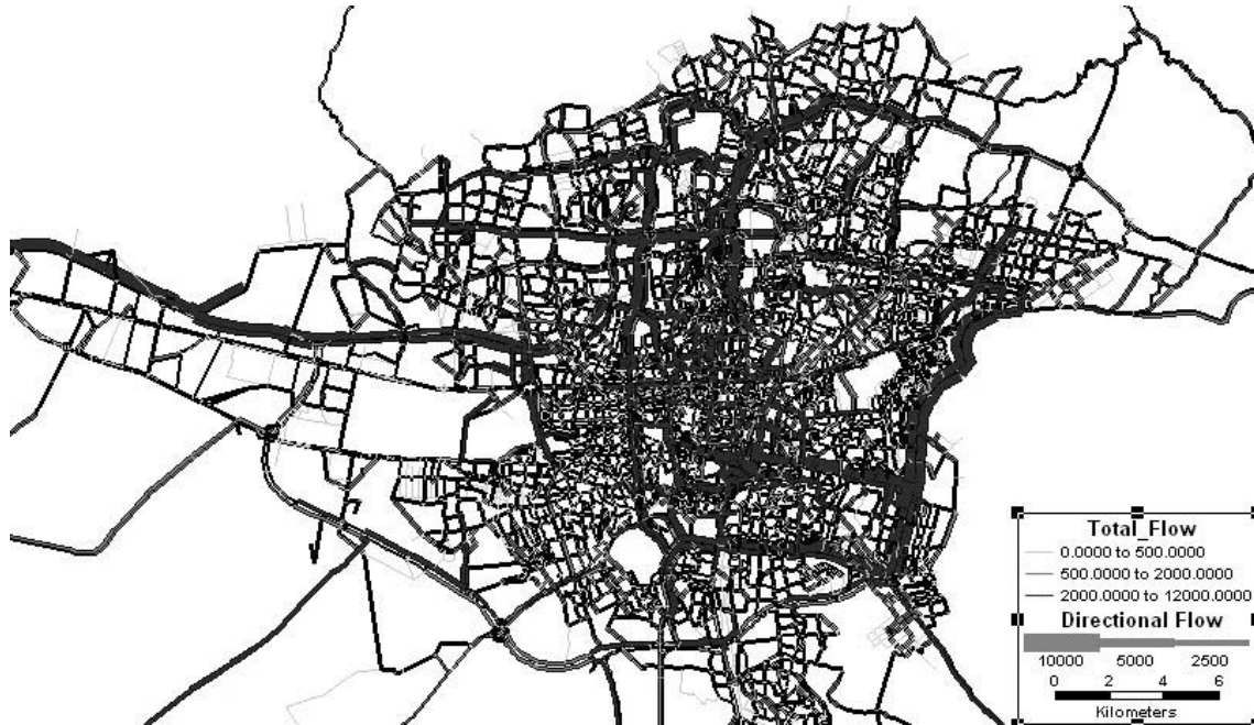
Fig. 2 Traffic volumes obtained from the CTDAM during a peak hour for Tehran network in 2007.