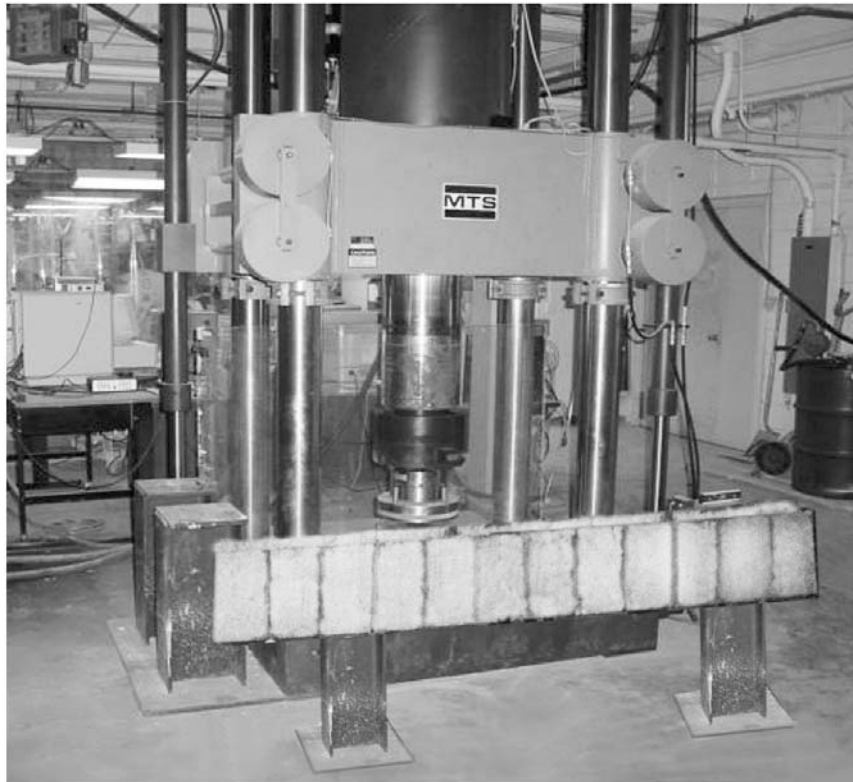
Fig.1 Test Set-up

concentrated load acting at mid-span, as shown in Fig 1.