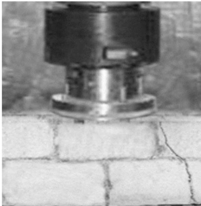
Fig. 3 Shear Failure for Beam Tests