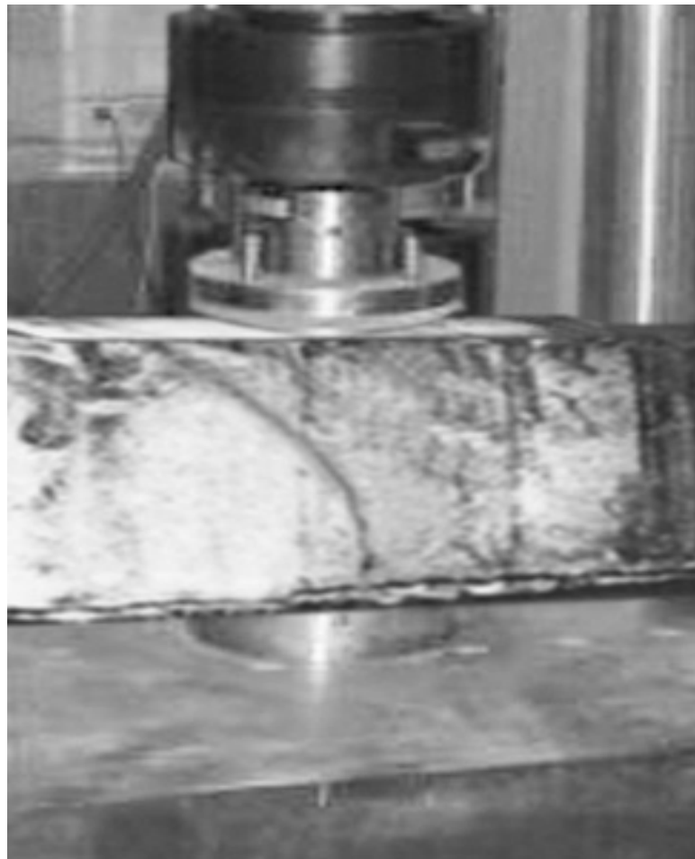
Fig. 4 Shear Failure of Beam with GFRP